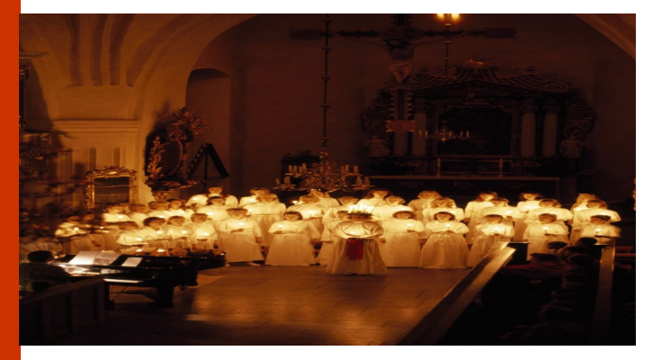
13. attend a local choir or holiday concert, there are countless musical performances that will deliver all the Christmas cheer you desire.