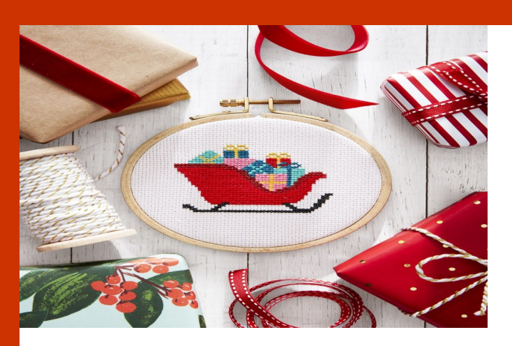
11. Try stitching a sweet something for a friend, teacher, or relative.