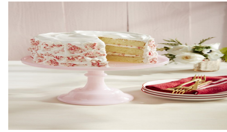
14. Bake your favorite cake.