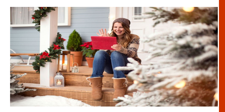
16. Video chat with an out-of-town friend or relative.