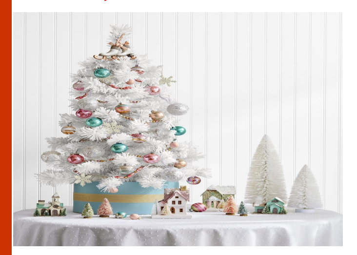
12. Decorate a tabletop tree