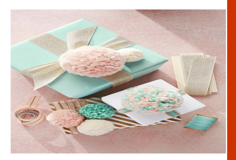
15. Play Secret Santa, a perfect way for gift giving that doesn't break the bank.